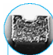
U-Shaped Product with Electrode Structure Processed product with grooves

High Precision Resistor Array & Networks