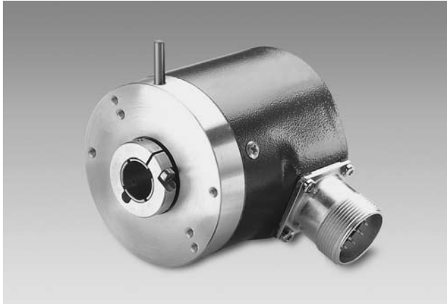
G0M2H hollow shaft