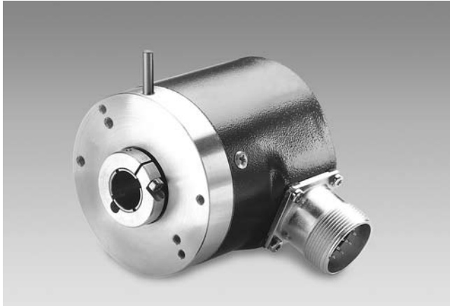
G0P5H with hollow shaft