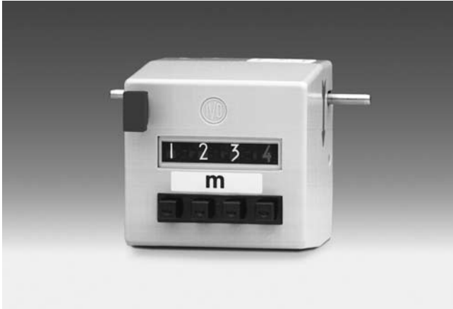
ME102 - Meter counter