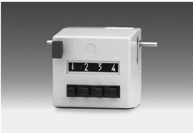
UE102 - Revolution counter